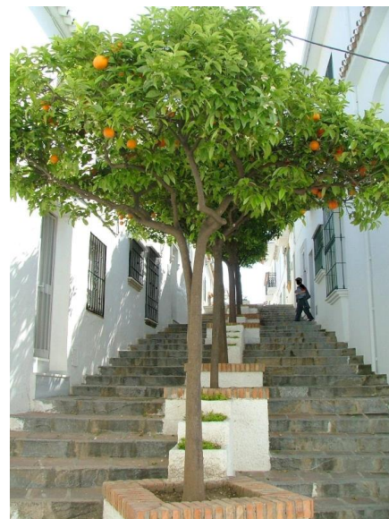
Potted Citrus Trees